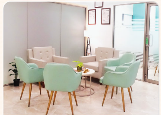
Our Cosmetology Department